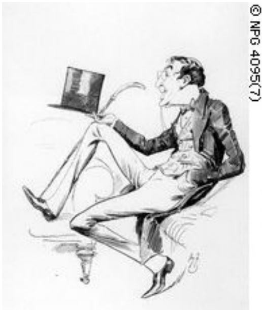
Henry Brodribb Irving

Sir Henry Irving had two sons, Harry Brodribb (b. 1870) and Laurence (b. 1872). They were educated for other walks of life, the former the bar, and the latter for the diplomatic service; but both turned to the stage, and the elder, who had already established himself as the most prominent of the younger English actors at the time of his father's death, went into management on his own account.